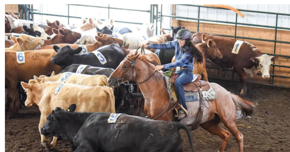
COMPETITIVE EVENTS ARE OUR SPECIALTY

Here's to many more years of their continued success and contribution!