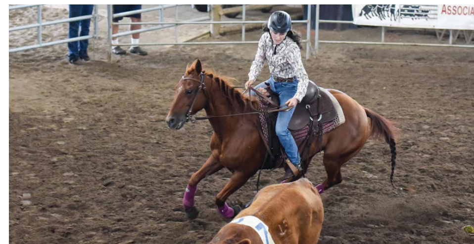
YEAR ROUND INDOOR FACILITY

Becoming a member includes the use of the indoor arena year-round, the outside arena and rodeo grounds as well as access to the amazing trails of the little Red river park. Once a member there is no minimum volunteer requirement. Following our clubs bylaws, once you are a member in good standing for over a year, you will have important voting rights in the falls AGM held annually.